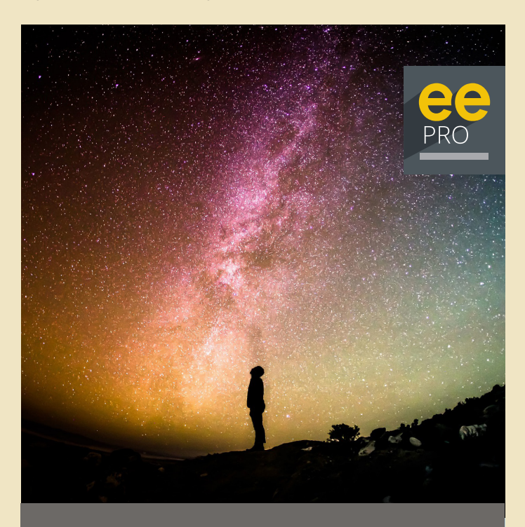
NAAEE continues to maintain and grow eePRO as a high-performing, technology-based EE platform. The monthly webinar series "Bringing New Ideas and Innovation to the Field of EE" brings a wide variety of topics to the online EE community: Embedding Justice and Equity in Organizations, Presentations for Impact, Connecting People to Nature, and much more. See a complete list and listen to all past recordings: https://naaee.org/eepro/learning/monthly-webinar-series

Access to Info & Materials: Expanding content and growing number of users of eePRO, an online professional development hub