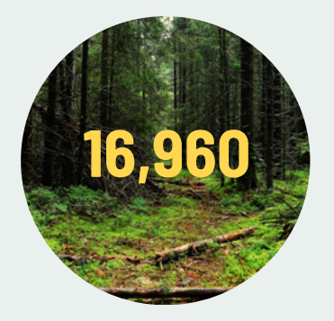
eeNEWS subscribers-up 21%