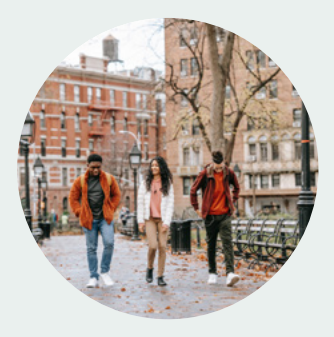
Support our scholarship fund