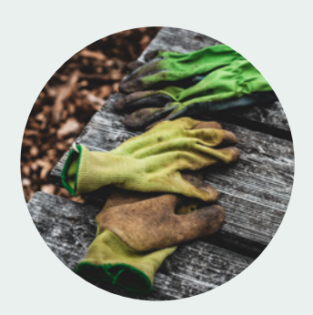
Make an estate planning gift through trusts, wills, and other instruments