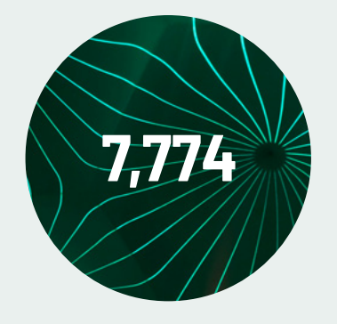
eeJOBS subscribers-up 47%