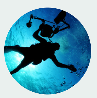
Make a one-time cash gift

For more information and to contribute, visit: naaee.org/donate