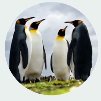
Become a member