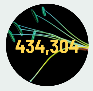
unique users—up 67%